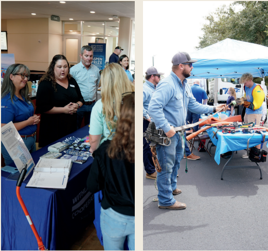
Above: WREC at the Expanding Agriculture Expo.

WREC is proud to participate in local high school career fairs, engaging with students to spark interest in careers within the energy industry. These events provide a valuable opportunity for WREC to introduce students to a wide range of career paths, from linework and engineering to communications and Member service, while encouraging them to explore their future potential. Through these efforts, WREC continues its commitment to education, workforce development, and investing in the leaders of tomorrow.