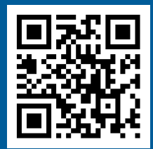
Scan to visit wrec.net

CONNECTIONS is published by: Withlacoochee River Electric Cooperative, Inc.