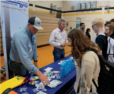
Above: WREC at the Citrus High School College and Career Fair.