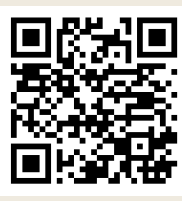
Scan to Report