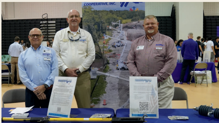
Above: WREC at the River Ridge High School College and Career Fair.